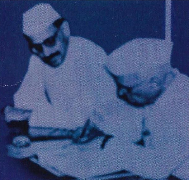
PANDIT JAWAHARLAL NEHRU, FOUNDER PRESIDENT OF BSS DEDICATING BHARAT SEVAK SAMAJ TO THE NATION SITTING NEXT TO HIM IS SRI GULZARILAL NANDA, FOUNDER CHAIRMAN OF BSS